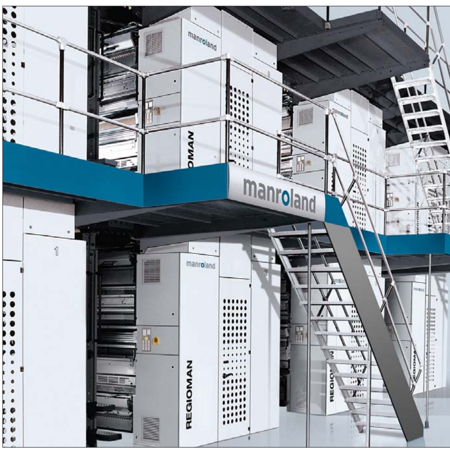
"In order to be competitive on the world market we must drastically reduce our maintenance costs and that quickly." From an inquiry from a large chemical company

Planning needed materials and having them prepared for the maintenance tasks optimises the logistics.